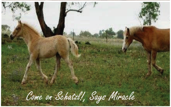
Come on Schatzl!, Says Miracle