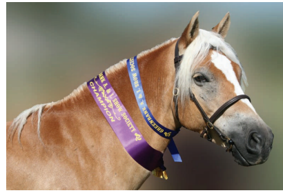
Antonie, Champion Haflinger at Greenbank