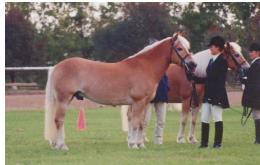
Nougat at Castle Hill Show