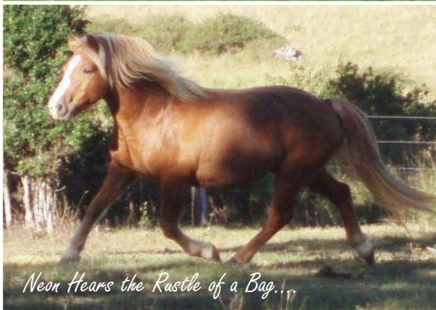
Neon Hears the Rattle of a Bag...!