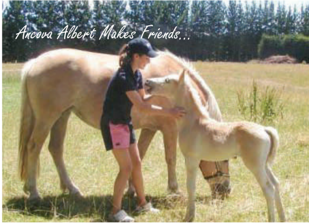
Ancova Albert Makes Friends...