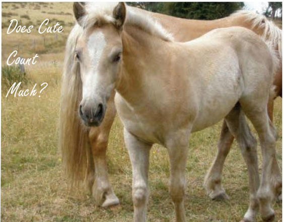
Does Cute Count Mach?