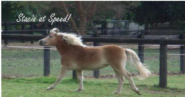
Stacia at Speed!